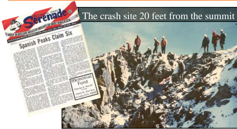
The crash site 20 feet from the summit

He had flown this route many times during his career.