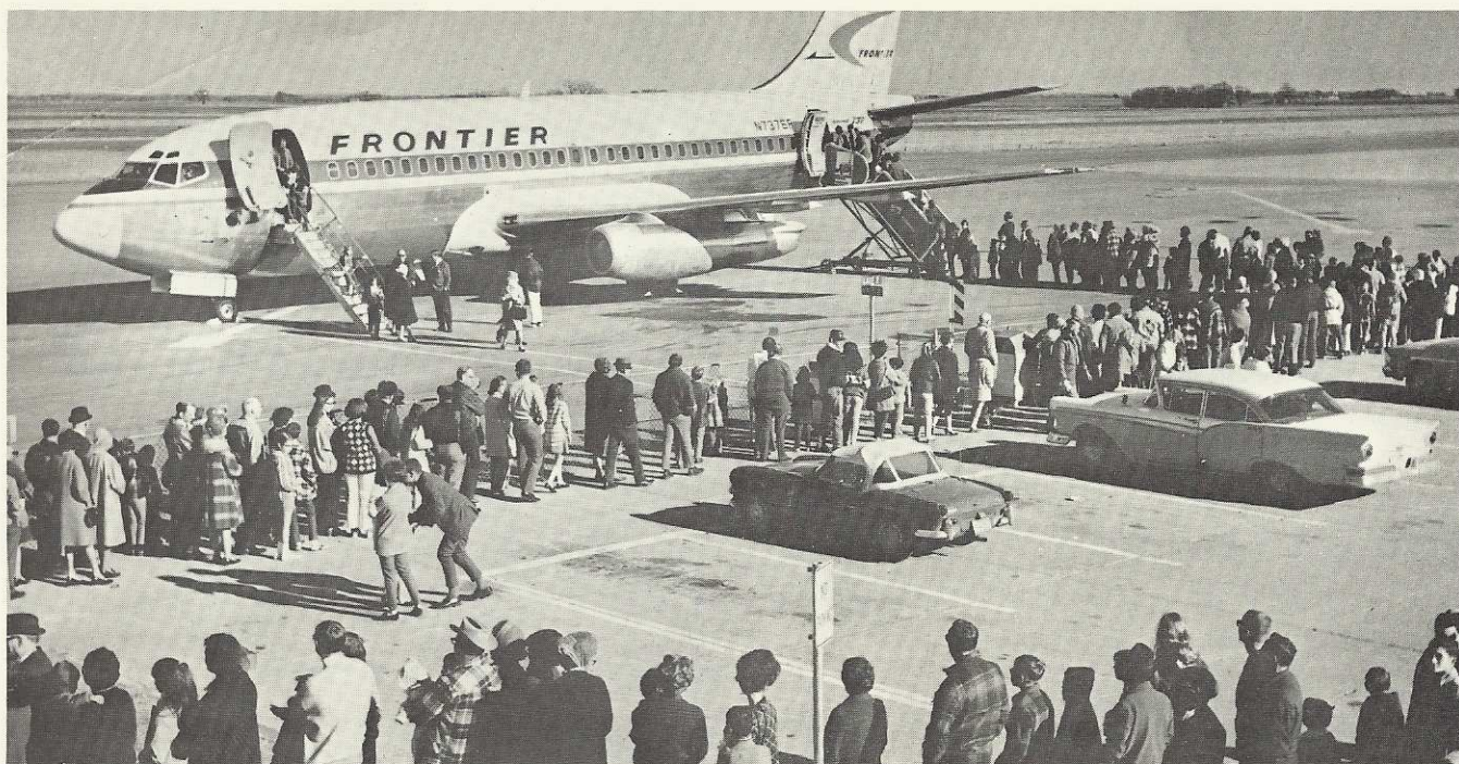
Residents of Scottsbluff, Nebraska turned out in force to get a sneak preview of the Boeing 737 aircraft due to begin providing daily flights for their community. The 737 service began March 1 for BFF as an intermediate stop on a route between Denver and Dallas by way of BFF, LNK and MKC.