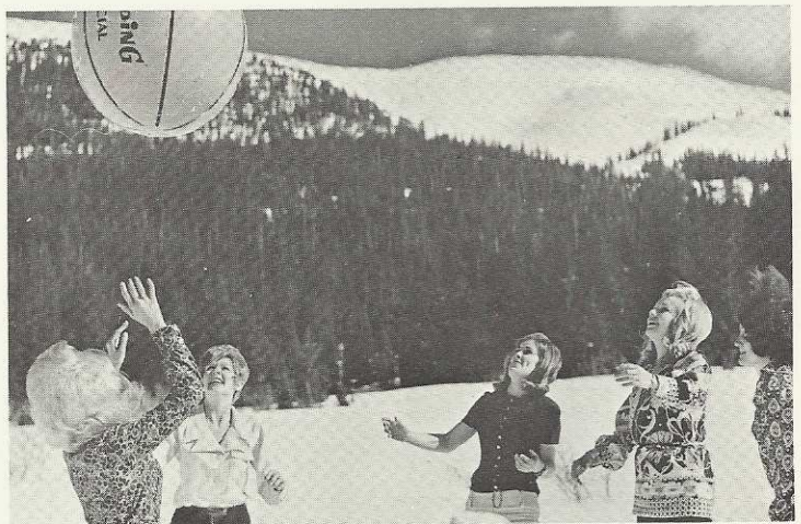
High altitude, deep snow and low temperatures at the Frontier Jets training camp on the continental divide was a sharp contrast to the mild temperatures and warm, sunny days in which the Pzazzers worked out.

The Frontier Jets have already begun plans for a more rigorous training program in order to win back their championship title.