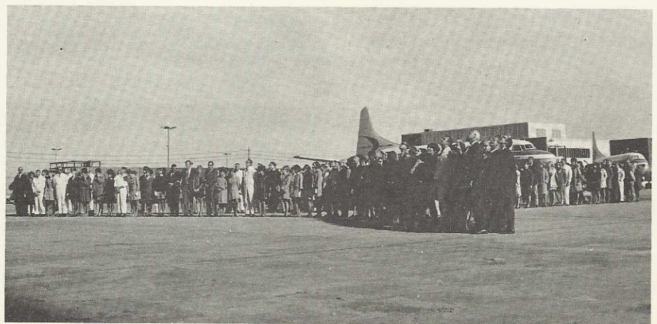
It'll never get off the ground... from where this picture was taken, it's hard to tell, but from atop the hangar looking down, all those Frontier personnel are standing in specific spots forming the design of a Boeing 727. Personnel taking part in the program represented a crosscut of all departments from throughout the company.