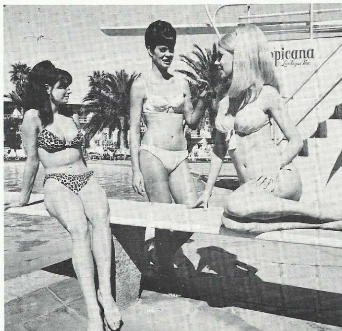
ADDING MORE SCENIC BEAUTY to the swimming pool at the spacious Tropicana in Las Vegas are three of the Hotel's popular show girls. No wonder Frontier's Las Vegas flights are filled to capacity.

Frontier Airlines Consolidated Reservations Office has been opened in St. Louis. Staffed with 15 personnel, at the beginning, this office will expand to employ fifty reservations people by June. Reservations phone calls originating in Topeka, Kansas and Joplin and St. Louis, Missouri will be handled by the new Gateway City complex.