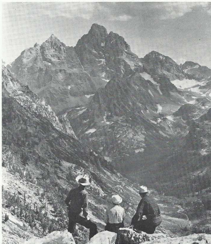
HIGH, RUGGED MOUNTAINS and lush green valleys distinguish the heartland of the Rocky Mountain West which forms the backyard for the finest in dude ranch country, where everyone learns to get on a first-name basis with newly formed friends while vacationing in Best of West country.

It all adds up to a great way to do something for your country while having a lot of personal fun "discovering" America at its best.