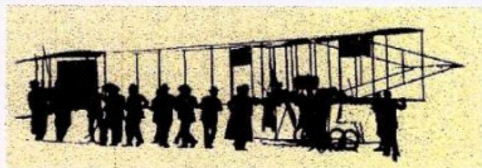
Preflight - The first heavier-than-air flight in Colorado - February, 1910 - Denver's Overland Park Racetrack. Pilot - Frenchman Louis Paulham, flying a Henri Farman biplane