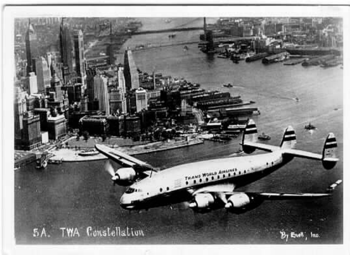
5A. TWA Constellation